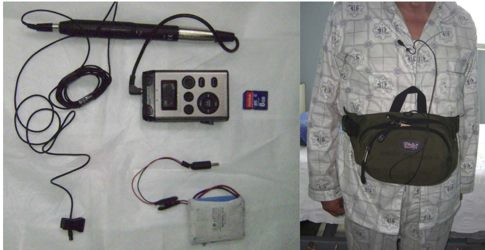
Figure 2 Picture of the Cayetano Cough Monitor (CayeCoM).

algorithm. On the basis of classifier outputs, each acoustic event will be marked as ‘cough’ or ‘not-cough’.